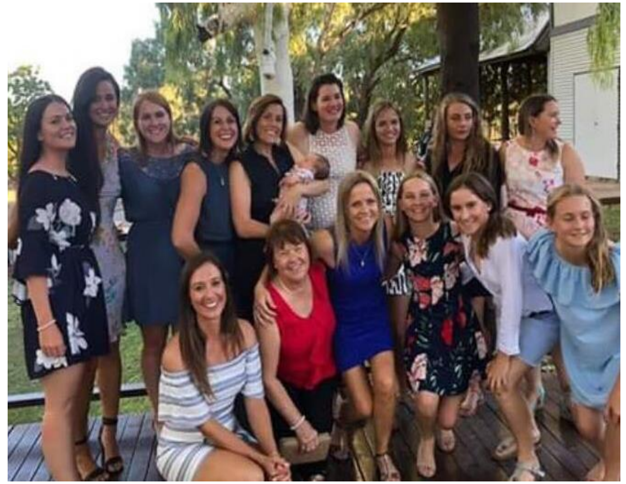
Kimberley Rural Ladies Lunch: Proving that you can raise money for FOP wherever you are, the ladies of the Kimberley region held a lunch in Fitzroy Crossing which including an auction and raffle. This raised $5,000 towards FOP research.