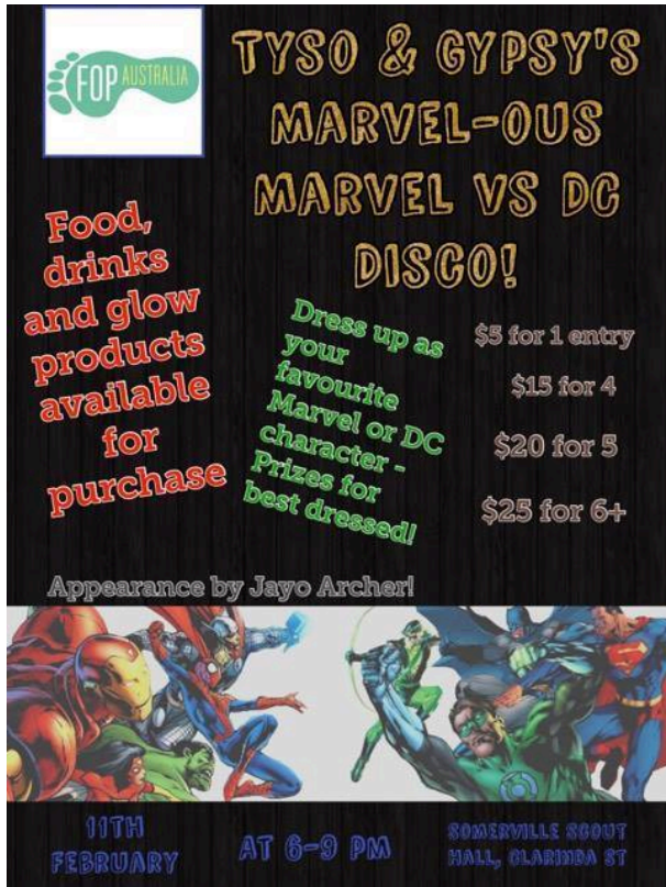
Promotional poster for disco in Somerville, Victoria