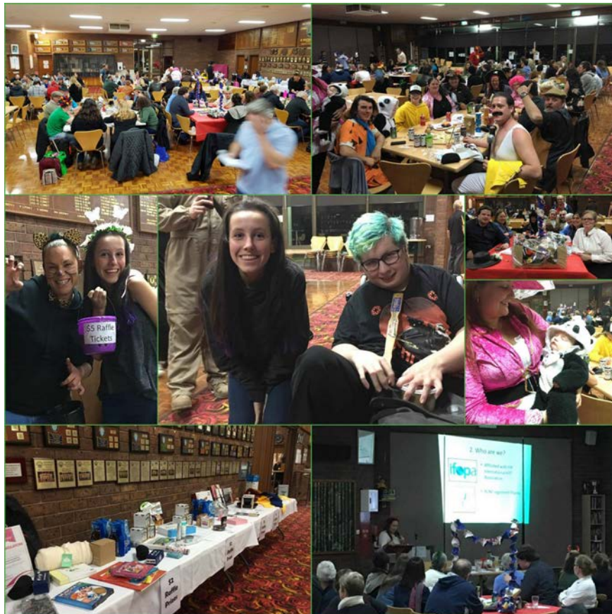
Quiz Night Extraordinaire, Somerville Victoria