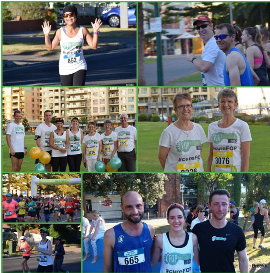
Participants in the Bay-City fun run in Adelaide, South Australia